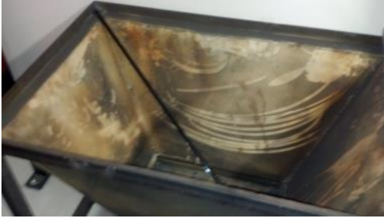
8 Plasma cut catch bin