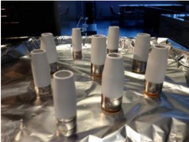
4 MIG nozzles coated in tool crib area