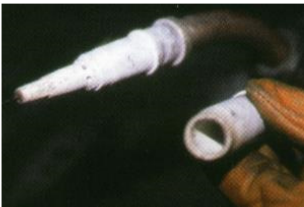
6 Applied to MIG tip, diffuser and nozzle