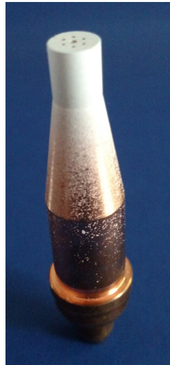
7 Oxy-Fuel Cutting Tip