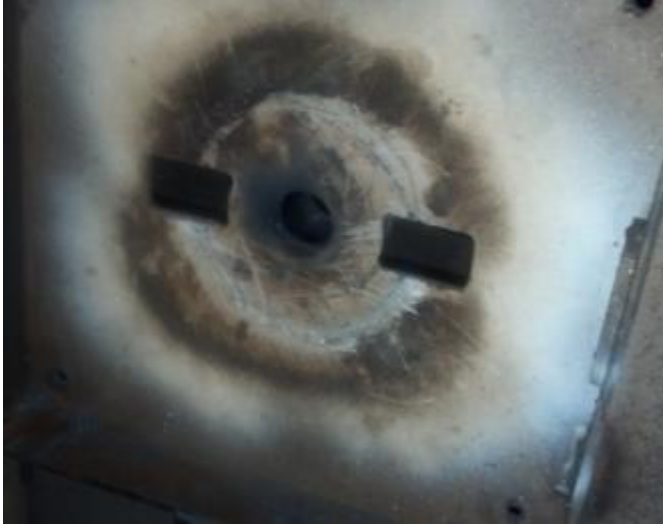
3 Fixtures stay slag-free