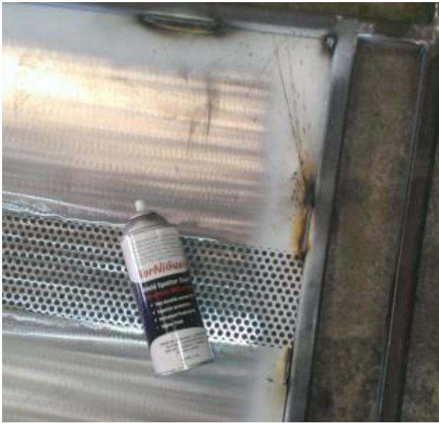
9 Applied to welded part