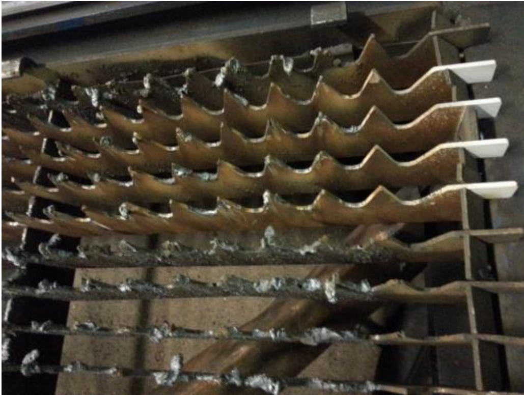
1 Applied to 4 slats to compare side-by-side